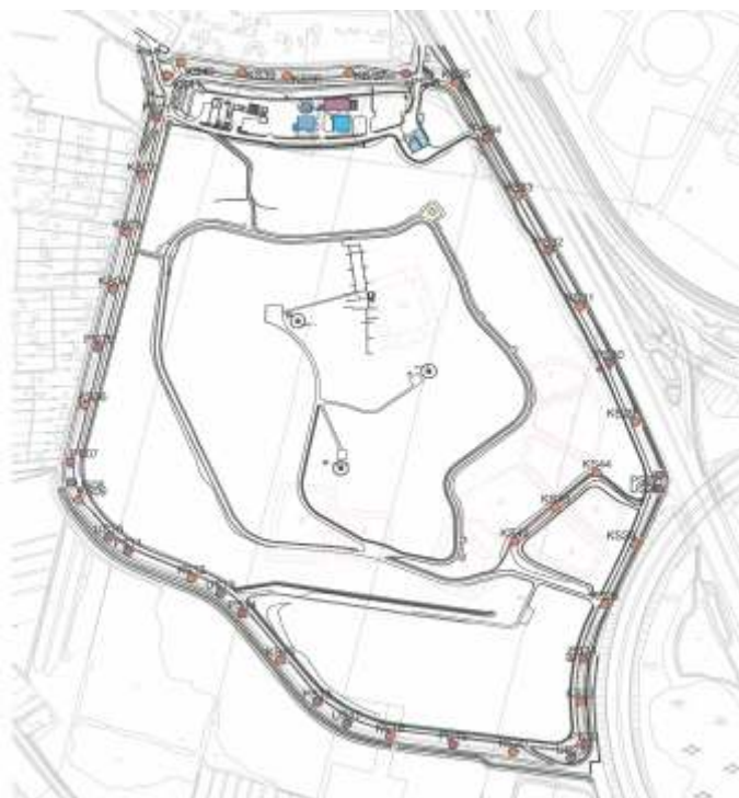
Schematic drawing of the pump shaft with the progressive cavity pump in the vertical position.

Since 1993, a 2.5-km ring drainage system with 44 shafts capture the leachate water. Thirteen of the shafts are pumping shafts. One Allweiler® progressive cavity pump has been installed in each of these shafts since 1994. They switch on automatically depending on the fill level of the shaft. They pump approximately 1.1 m 3 of leachate water per hour through a pressurized piping system to the main three-stage processing plant. At the plant water, oil, and contaminated sludge are separated. All fractions are either used separately or disposed. The pumps move approximately 12,000 m 3 per year, 95% of which is water; the remainder being oil. After processing, approximately 0.5 m 3 of sediment remains. Delivery head to the sedimenter is 8 m, with a discharge pressure of about 3 bar. During normal operations, the pumps run at about 200 1/min and move between 4 and 7 m 3 per hour.