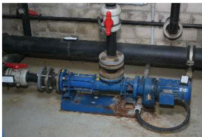
Allweiler® progressive cavity pump of the SEBP series in the groundwater treatment facility. Following a strictly defined settling time, these pumps move the settled water phase out of the sludge holding containers and into the preliminary pumping system.

In contrast to the ring drainage pumps, the progressive cavity pumps of the ALL-OPTIFLOW® series operate continuously in the wells. They are dry-mounted and operate 360 days per year. Outlet pressure is 3 bar and capacity nearly 10 m 3 per hour. The groundwater that they pump contains high levels of iron (about 100 mg/l), making them aggressive. Due to the chemical properties of the liquid and the need to operate continuously, these pumps have a much shorter service life than those used in ring drainage. "On average, we need one new stator every year," according to Mr. Sellenk. But without the special design of the Allweiler® pumps, the service life would be even shorter. With its unusually long stator and rotor, pumps of the ALL-OPTIFLOW® series are designed for a long service life, even when pumping difficult liquids. Here as well, the stator elastomer is designed specifically for the properties of this liquid. Rotors of the ALL-OPTIFLOW® series also exhibit a special "sharkskin" surface that improves efficiency.