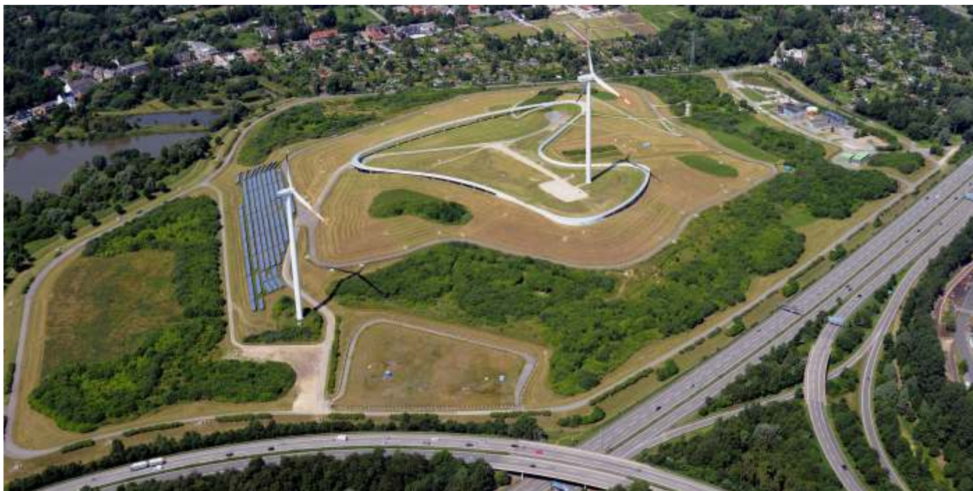
Aerial view of the sealed landfill

Although the landfill has been sealed and no new waste is deposited at the site, leachate water must still be collected and treated before it can be directed into the public sewer