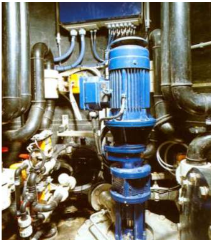
Progressive cavity pump in a shaft

In the past few years, the only spare parts we needed were two stators and one joint." Customers can also choose between different joint versions with varying levels of quality versus cost.