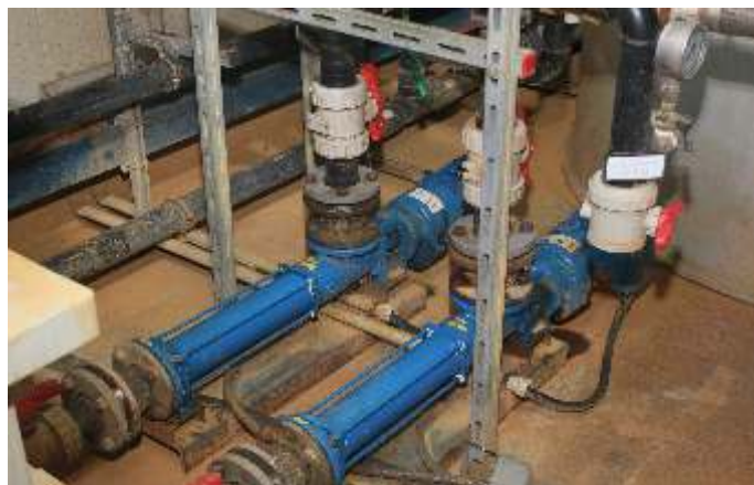
The two ALL-OPTIFLOW® pumps that pump groundwater within the barrier.

Since 1998, a barrier outside of the landfill captures contaminated liquids that have already left the site. Well pumps move these liquids to the groundwater processing facility. The treated water then flows into the Elbe.