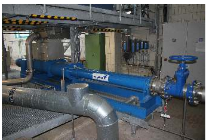
Four-stage solid-substance progressive cavity pump, type AE4N1450-RG from Allweiler®, used as residual sludge discharge pump, below the centrifuge.