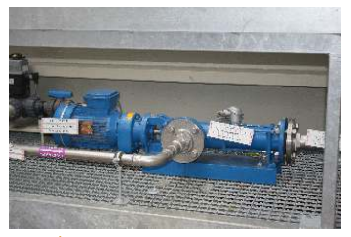
Allweiler® progressive cavity pump used as metering pump.