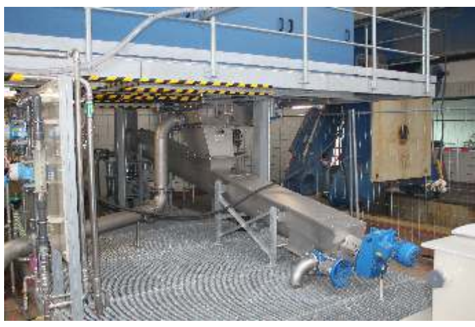
The inclined conveyor moves sludge from the top into the silo.

special pump design does not require a bridge breaker, and the pump's design height is significantly smaller than similar pumps from other manufacturers. Even when starting, there are no disturbances because the break-out torque (starting torque) is very low. The pump is regulated by a frequency converter and runs at 30 to 60 Hz. The low rotational speed makes a major contribution to achieving the anticipated long service life.