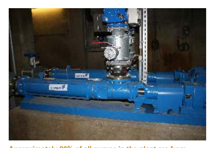
Approximately 80% of all pumps in the plant are from Allweiler®, including the thin sludge pumps in this photo.

The Duisburg-Kasslerfeld sewage plant is the largest in the Ruhrverband, a non-profit water management company serving the Ruhr and Lenne catchment areas in western Germany. Approximately 50% of the wastewater volume comes from households, with the remainder from a variety of industrial operations, including tank cleaning, beverage production and the Duisburg Zoo. In recent years, plant operators decided to replace the chambered filter presses with two centrifuges. During the course of the conversion, the plant set up two systems for discharging drained sludge to compare reliability and efficiency: a centrifuge with an inclined conveyor and a centrifuge with a progressive cavity pump from German manufacturer Allweiler®, which has been part of Colfax Fluid Handling, a division of American firm Colfax Corporation (NYSE: CFX), since 1998. According to Dipl-Ing. Ralf Wilms, Operational Group Leader in the West regional zone of the Ruhrverband, "We wanted to know whether a discharge pump would be a more economical and reliable solution than a conventional inclined conveyor."