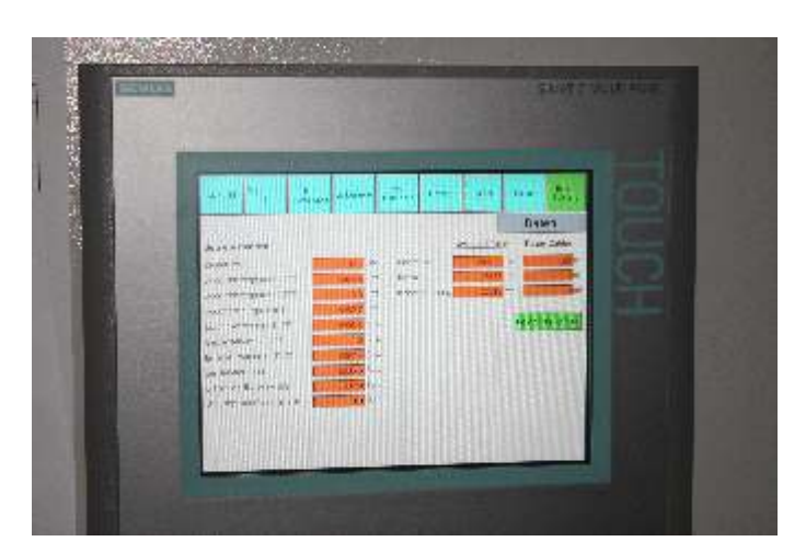
In nearly 7000 operating hours, there has been no recorded loss of performance and no failures. Allweiler® anticipates another 15,000 operating hours before the first maintenance.

Materials selection and optimized dimensioning of the pump unit are important requirements for disturbance-free operation. Technical design characteristics that match the pumped liquid are also important considerations. In addition to energy consumption, low costs for spare parts and maintenance are decisive for maintaining economical operation: Allweiler® is one of just a few manufacturers that makes its own stators and rotors. As a result, Allweiler® specialists can select from 20 different stator elastomers and find the right combination that matches the chemical and physical characteristics of the pumped liquid and ensures the longest possible service life. This results in long maintenance intervals, minimal downtime, and very reliable, continuous operations. The discharge pump has already been in operation for 7000 hours without detectable wear. The manufacturer currently anticipates that the pump will complete 15,000 to 20,000 operating hours before needing overhaul.