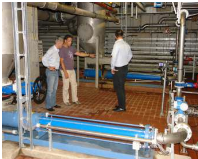
Comparative pumps of the AE4H750 series.

After an additional three months, pump capacity in the lower speed range was no longer sufficient and it was necessary to replace the stator. Berndt Fritsche, Director of Maintenance: "We were able to extend pump operation by another three months only by increasing its speed. In contrast, the capacity of the pump with the "Alldur®" stator remained constant for more than two years."