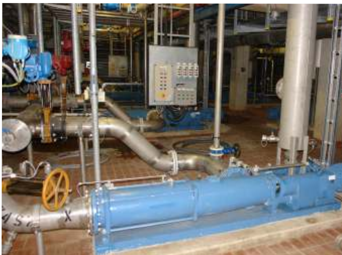
Feed pumps of the AE series for the filter beds.

Colfax Fluid Handling offers stators made of „Alldur®“ in progressing cavity pumps manufactured by Allweiler® in Bottrop, Germany. These pumps have been used for decades in a variety of applications, including many sewage plants in Germany and other countries.