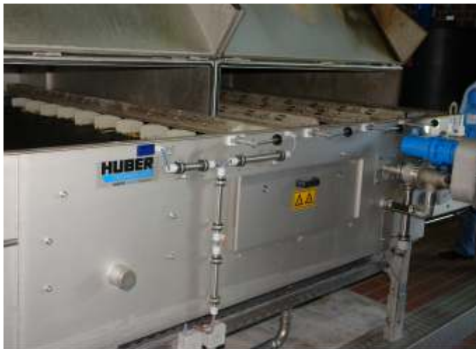
Excess sludge is thickened by filter belts manufactured by Huber of Germany.

By March of 2013, its capacity had dropped marginally by approximately 5 to 10% with a flat reduction of the capacity values.