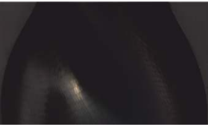
„Shark skin“ surface structure of the new „Alldur®“ stators.