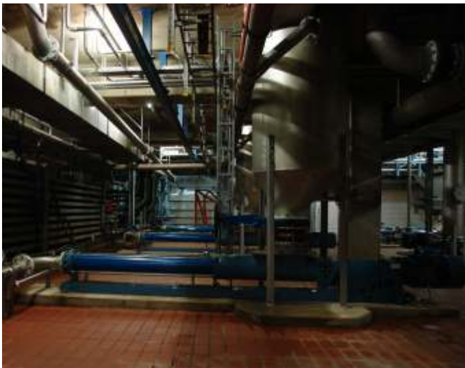
Discharge pumps of the AE series pump 5-10 m 3 /h of abrasive thick sludge at pressures of 8-12 bar.

another with "Alldur®" – were tested while pumping thick sludge from a thickening machine.