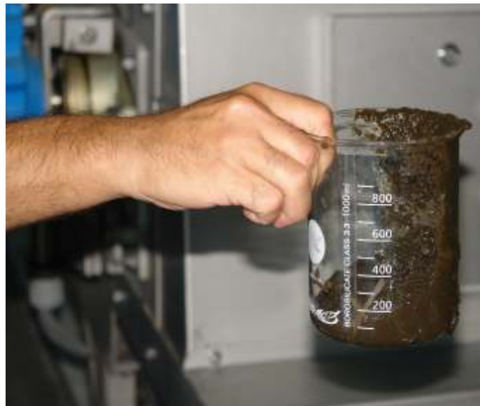
The pump moves 5 to 10 m³/h of abrasive thick sludge with 6% dry substance at a pressure of 8 to 12 bar.

They are characterized by their ability to easily pump liquids with a large proportion of dry substance and abrasive components. A variety of available designs and materials enable adaptation of the pumps to specific liquids and pumping conditions. Now, with stators made of „Alldur®“, they are even more economical.