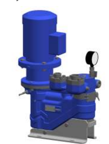
Twin unit provides extremely high security